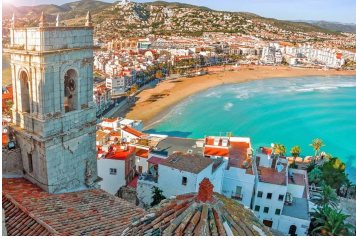
Breakfast, Lunch, Dinner

Today proceed on a guided city tour of Barcelona. Visit the Sagrada Familia Cathedral which has become Barcelona's most universal symbol. Visit the Olympic Village, Columbus monument and Montjuic Mountain where you will be able to see the Olympic Stadium. Later we take an unforgettable cable car ride into the sky above Catalonia – to Montserrat- spectacularly beautiful Benedictine monk mountain retreat. Overnight in Barcelona. (Breakfast/Lunch/Dinner)