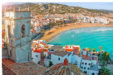
Breakfast, Lunch, Dinner

Today proceed on a guided city tour of Barcelona. Visit the Sagrada Familia Cathedral which has become Barcelona's most universal symbol. Visit the Olympic Village, Columbus monument and Montjuïc Mountain where you will be able to see the Olympic Stadium. Later we take an unforgettable cable car ride into the sky above Catalonia – to Montserrat- spectacularly beautiful Benedictine monk mountain retreat. Overnight in Barcelona. (Breakfast/Lunch/Dinner)